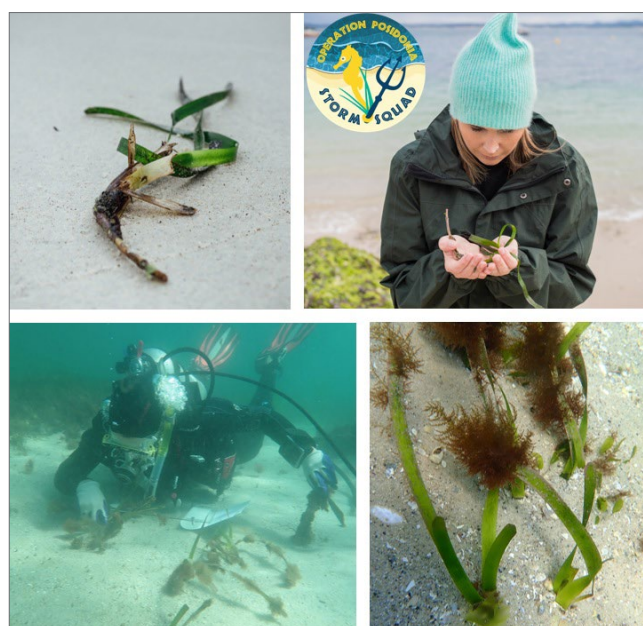
Figure 2. Posidonia australis transplantation sequence. Top left: Example of a fragment suitable for restoration; top right: beach collection by volunteers part of 'Operation Posidonia Storm Squad'; bottom left: Planting fragments into bare sand; bottom right: fragments nine months post planting.

'Operation Posidonia' outreach program has enabled the collection of more than 1000 P. australis fragments between October 2018 and April 2019. Fragments consist of shoots with attached rhizome. A pilot trial began in May 2018, replanting 267 fragments within two boat mooring scars (10 plots of 1 m x 2 m). Planting and monitoring were carried by SCUBA-divers (Figure 2). The fragments were anchored with wire pegs into old mooring scars consisting of either bare sediment (with or without stabilising jute-mats) or patches colonised by faster-growing seagrasses.