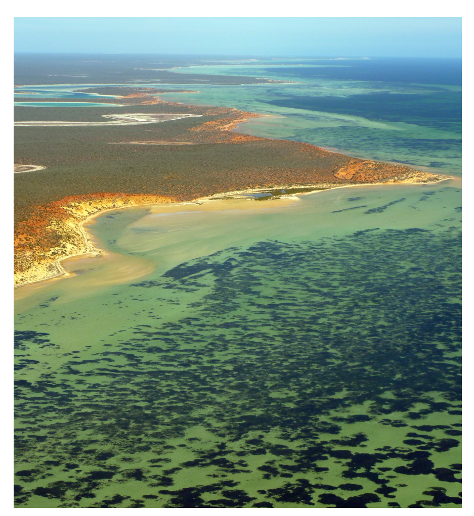
Seagrass meadows at Shark Bay.

About 72 seagrass species have been identified in the world. At least 12 of these are found in Shark Bay. This is in contrast to other regions of the world where fewer species grow together. Some seagrasses in Shark Bay are tropical species and others