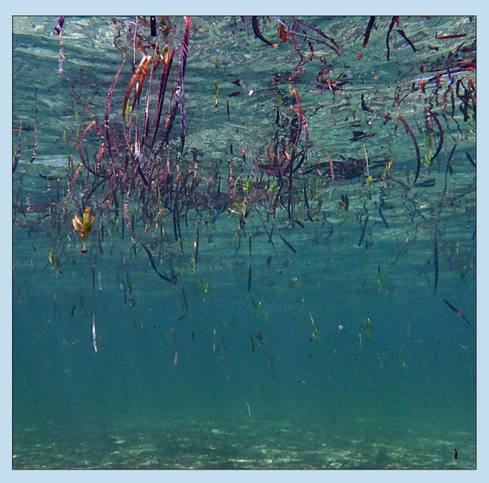
Above left: A healthy seagrass meadow (Amphibolis antarctica).

Above: Wire weed seedlings spend several weeks to months floating with the currents and tides, before eventually sinking to the seafloor and catching hold of something to grow on.